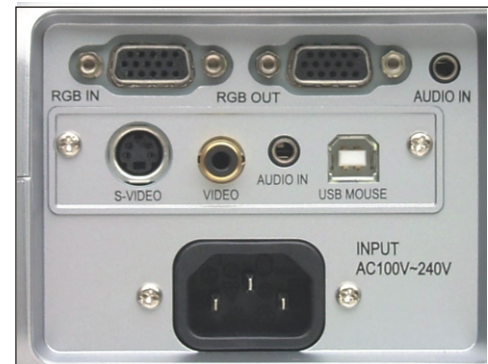
The ImagePro 8756A inputs are easily accessible.

At 7.2 lbs it's easy to transport with the included soft carry case. This value packed projector has a XGA resolution with advanced electronics that permit showing SXGA or VGA images. An IR remote control permits operation from convenient locations and can turn the projector completely "On" or "Off".